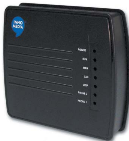
Standalone MTA 6328-2Re with 2 voice ports

VoIP performance metrics reporting allowing service providers to offer SLA based services