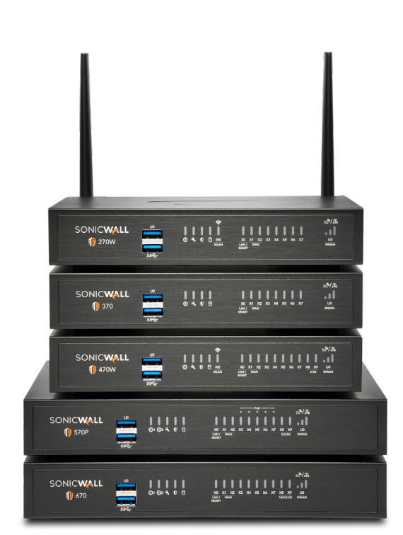
Top to Bottom: SonicWALL TZ270W, TZ370, TZ470, TZ570, TZ670