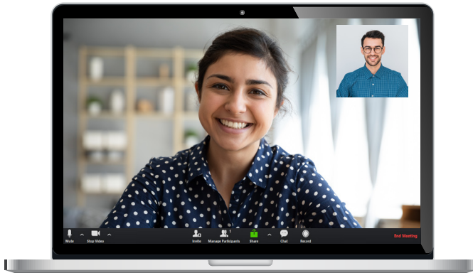
MaX UC Meeting for Windows/Mac

You can take advantage of this offer even if you are in contract with your current voice provider, and it can work with many systems. Call us to see if it might work for you.